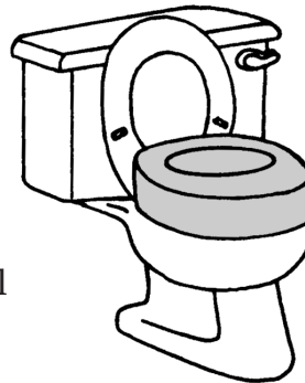
Raised (elevated) toilet seat

If the mobile person is missing the toilet, get a toilet seat in a color that is different from the floor color. This may help him see the toilet better. If the person with AD fails to remember to wipe himself or wash his hands, you will have to prompt him to do it, help him to do it, or do it for him.